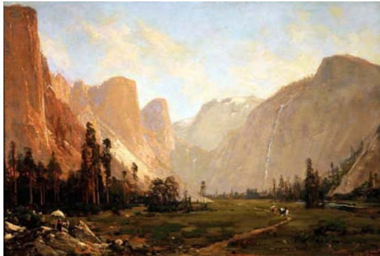
top: Maurice Braun, Yosemite, Evening from Glacier Point , The Irvine Museum above: Thomas Hill, Following the Trail of Hetch Hetchy , The Irvine Museum