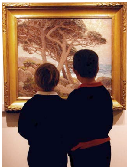
Students from St. Catherine of Sienna Parish School study Sentinels of the Coast by Edgar Payne